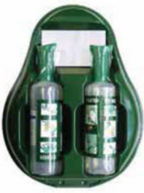
Eye Wash 16Oz x 2