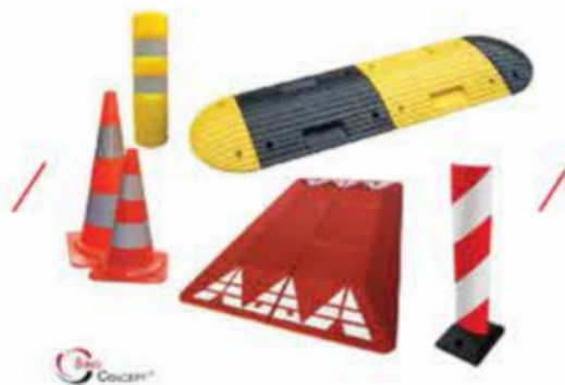
Lineators & Others