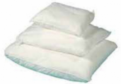
Spill Absorbent Pillow