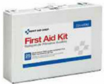
First Aid 25 Person OSHA Metal