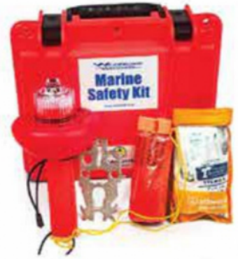
BOATING SAFETY KIT