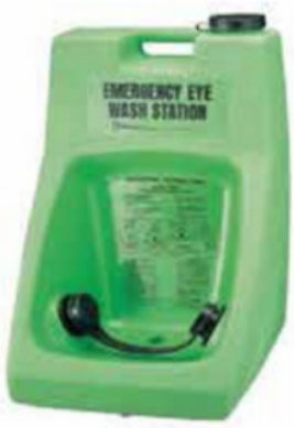
Eye Wash Station India