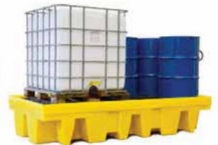
Pallet 4 Drum