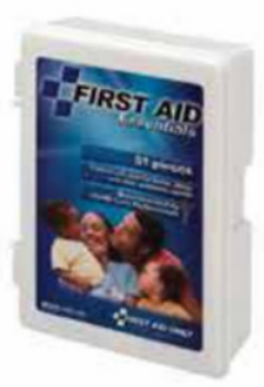
First Aid 10 Person