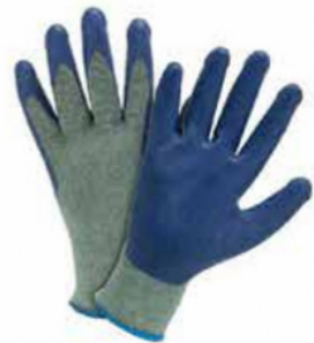
Latex Coated Gloves