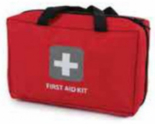
First Aid bag