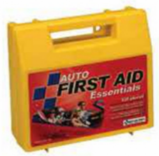
First Aid Travel Kit