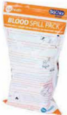
Bio Hazard Absorbent