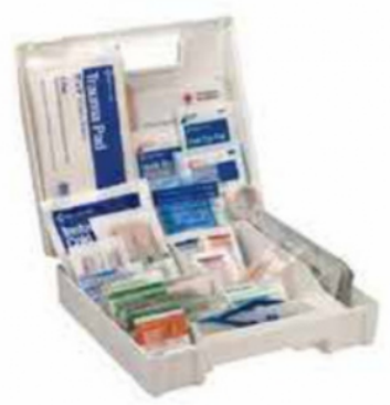
First Aid 20 person