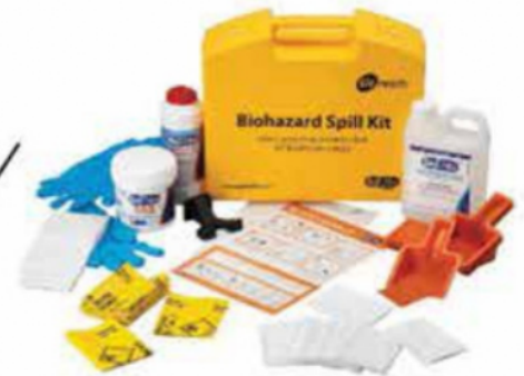
Bio Hazard Spill Kit