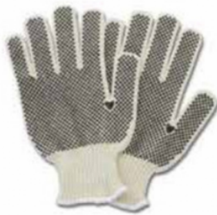
Double Cotton Knitted Gloves