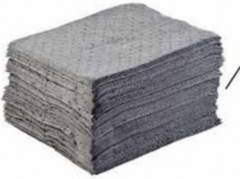
Universal Spill Pad