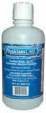
Eye Wash Bottle