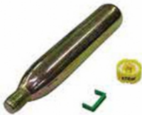
AUTOMATIC INFLATABLE PFD-REARMING KIT CARTRIDGE