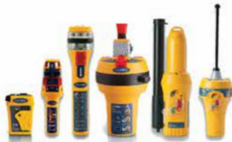
OCEAN SIGNAL SURVIVAL