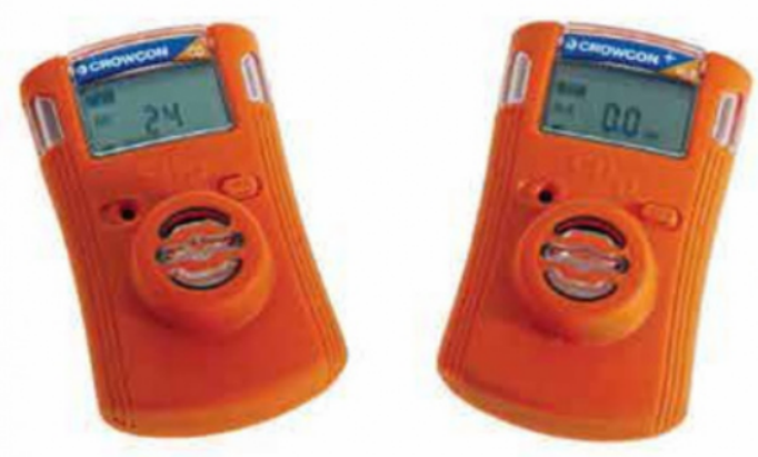
Crowcon Gas Detector