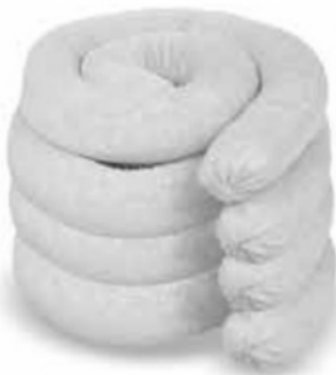
Spill Absorbent Granules