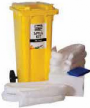
Oil Spill Kit