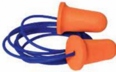
Ear Plug w/ Cord