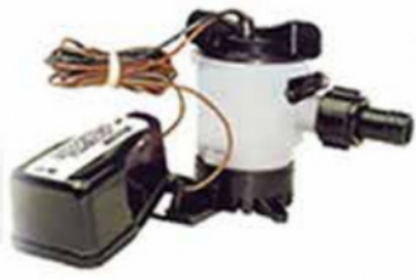
MARINE PUMPS SPARE PARTS