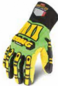
Cut Resistant Gloves