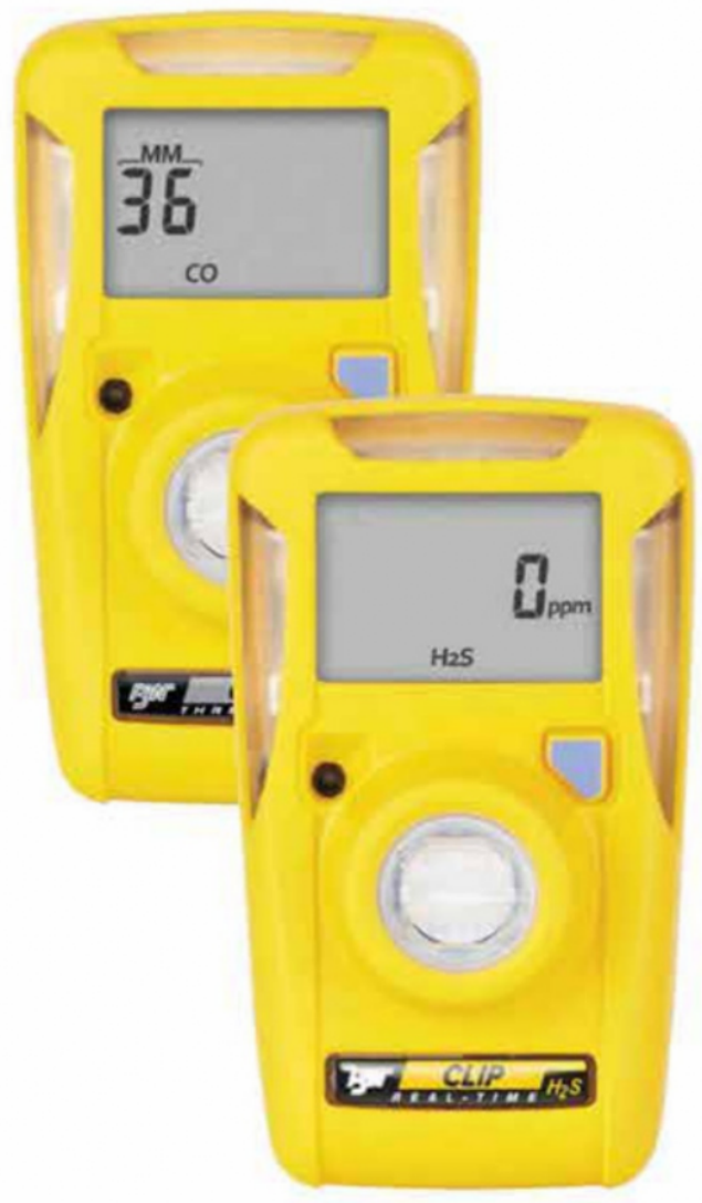
BW Clip Gas Alert