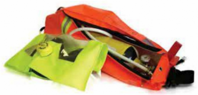
Bio Fenzy Escape Hood