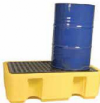
Pallet Two Drum