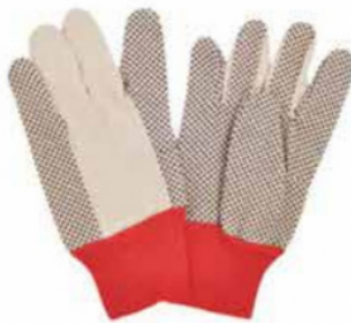
Cotton Knitted Gloves