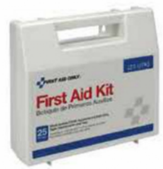
First Aid 25 Person OSHA