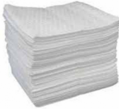
Spill Pad Oil & Chemical