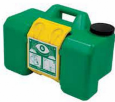
Eye Wash Station HAWS