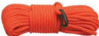
BUOYANT HEAVY LINE