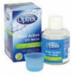
Optrex Eye Lotion