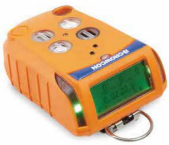
Multi Gas Detector