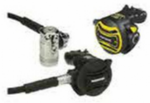
APEKS MARINE UNISEX ADULT XTX200 DIN REGULATOR