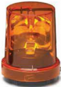
Rotating Flash Lights