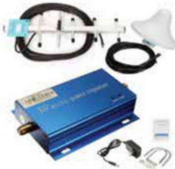
CELL PHONE SIGNAL REPEATER