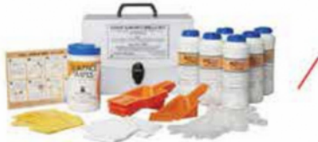
Urine/Vomit Spill Kit