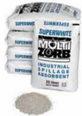
Chemical & Oil Absorbent