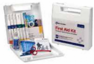
First Aid 50 Person OSHA