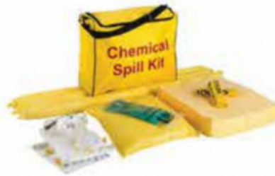
Chemical Spill Kit