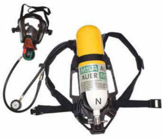
SCBA - Escape Set