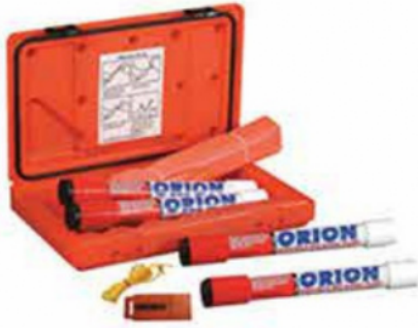
MARINE SIGNAL KIT-