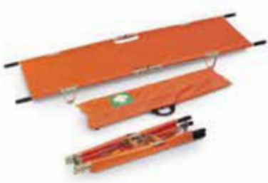
Two Fold Stretcher